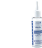
SMOKE OIL (100mL)